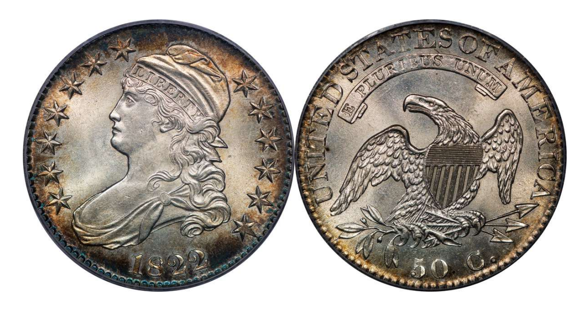
LOT 15 – 1822 O.113 R.3 PCGS MS 63