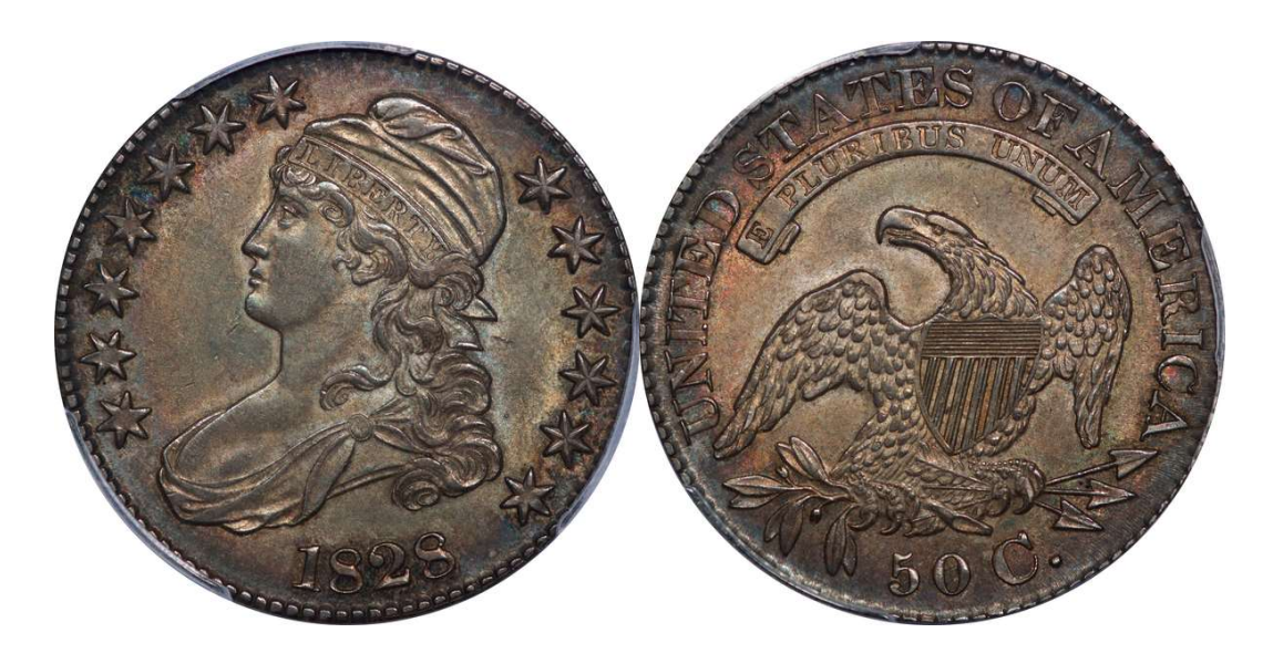
LOT 60 – 1828 Sq. Base Knob 2, Sm. 8s, Lg. Lets. O.117 R.1 PCGS AU 58 CAC

Richly toned and notable for the glow of sunset red in the fields. The surfaces are especially nice. Note, also, the detail in the eagle's claws and feathers. Here is a lovely coin for those who enjoy posting their bust halves in PCGS' Everyman registry sets.