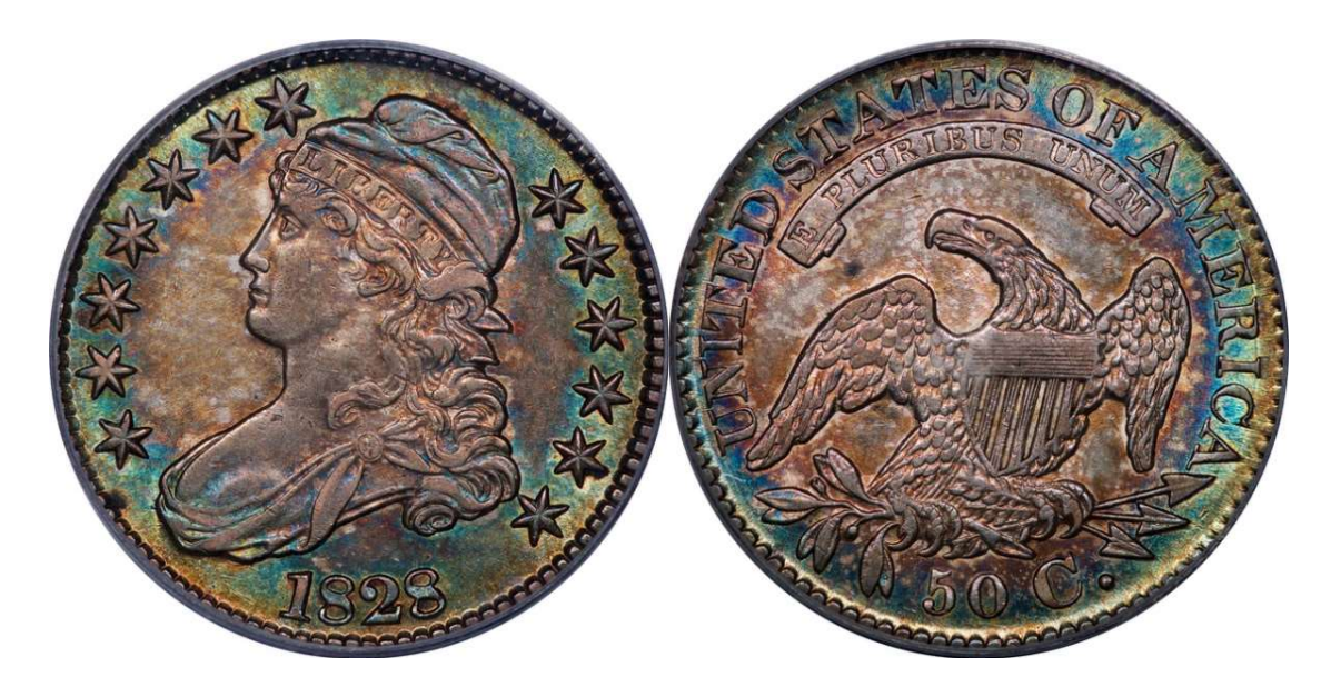
LOT 93 – 1828 Sq. Base 2, Sm. 8s, Lg. Letters O.114 R.3 PCGS AU 53 CAC

More album toning. Electrified shades of turquoise and sea green intermingle, forming a halo around the central devices. Give this one an A for eye appeal.