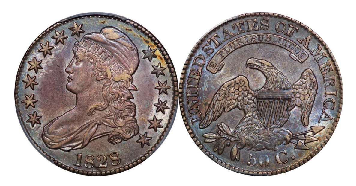
LOT 59 – 1828 Sq. Base Knob 2, Sm. 8s, Lg. Lets. O.110 R.2 PCGS AU 55 CAC

Iridescent shades of purple and ocean blue will tempt those on the lookout for attractively toned bust halves. Decent luster, stronger at the peripheries. The pleasing surfaces and exceptional eye appeal earned CAC's seal of approval.