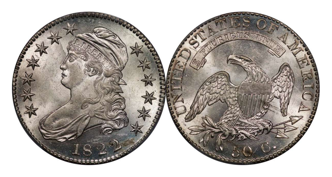
LOT 27 – 1822 O.103a R.4? PCGS MS 62+