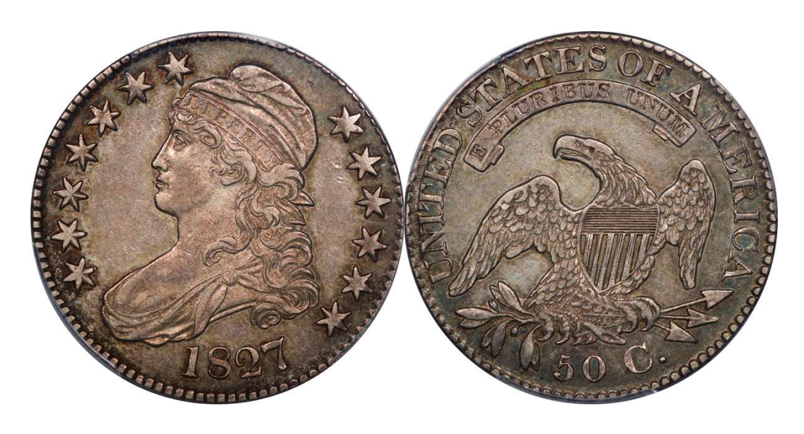
LOT 30 – 1827 Sq. Base 2 R.6 O.148 PCGS XF 45