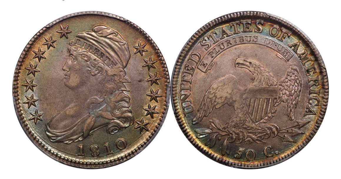
LOT 6 – 1810 O.102a R.1 PCGS AU 53

Glorious toning, obverse and reverse. The (invariable) weakness in the eagle's left wing is offset by A+ eye appeal. Shades of gold, turquoise, aqua and pastel red prance across the surfaces. Smooth surfaces complete the picture. A charming 1810.