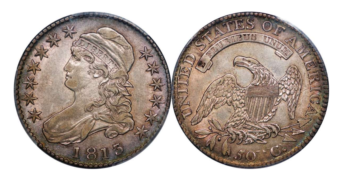
LOT 36 – 1813 50/UNI O.101 R.1 PCGS XF 45

Exceptional luster for the assigned grade. Sharp early die state with UNI boldly impressed at the denomination. Light grey centers, pale russet at the peripheries. A popular Red Book variety in an affordable grade. We expect a bushel of bids. From Stack's/Bowers' October 2023 sale, lot 94192, @ $1,440.