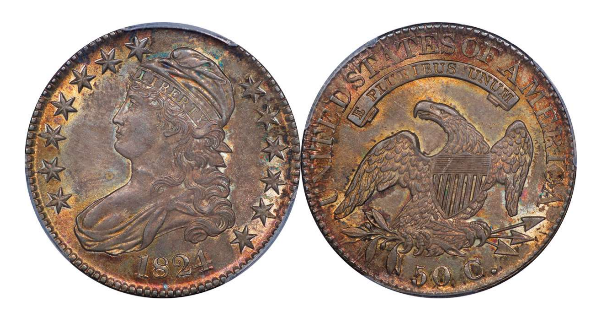
LOT 50 – 1824 O.113 R.2 PCGS MS 63

Another mind-boggling, beautifully toned bust half. The peripheries are alive with resplendent gold, turquoise and crimson iridescence. Antique grey centers and adjoining fields sparkle with flakes of gold-leaf. What to say but WOW !