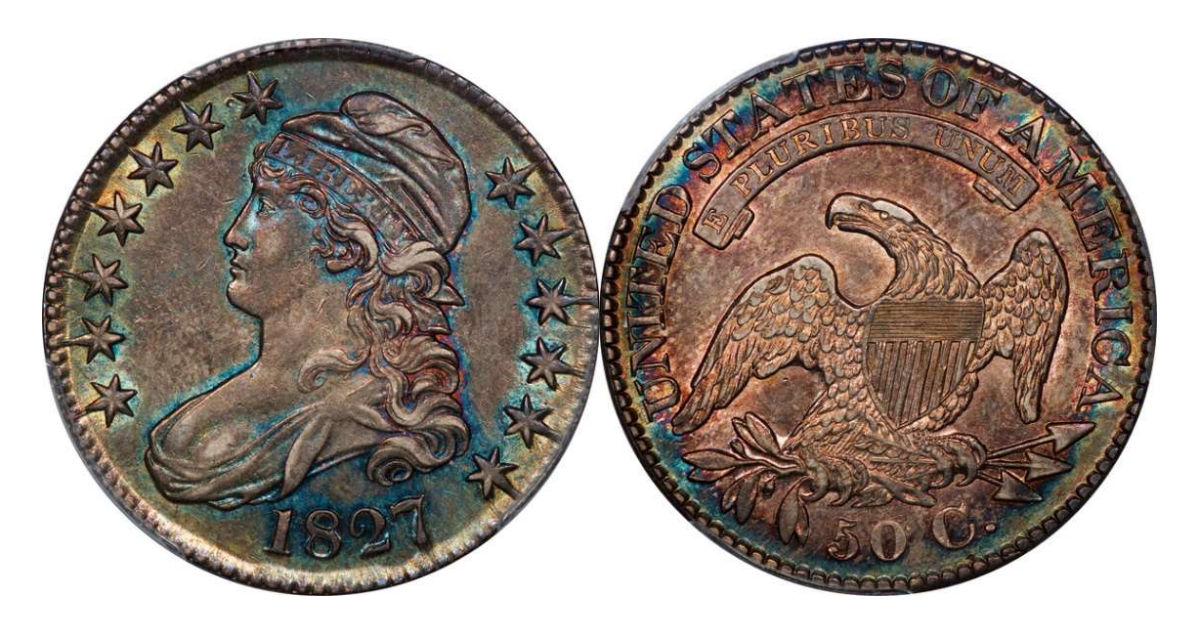
LOT 92 – 1827 Square Base 2 O.143 R.4 PCGS AU 55

The color parade continues. Hues of turquoise, gold and crimson blanket the surfaces. Luster meets expectations. Eye appeal is well above the norm. The consignor found this one in my bourse case at the January 2002 FUN Show.