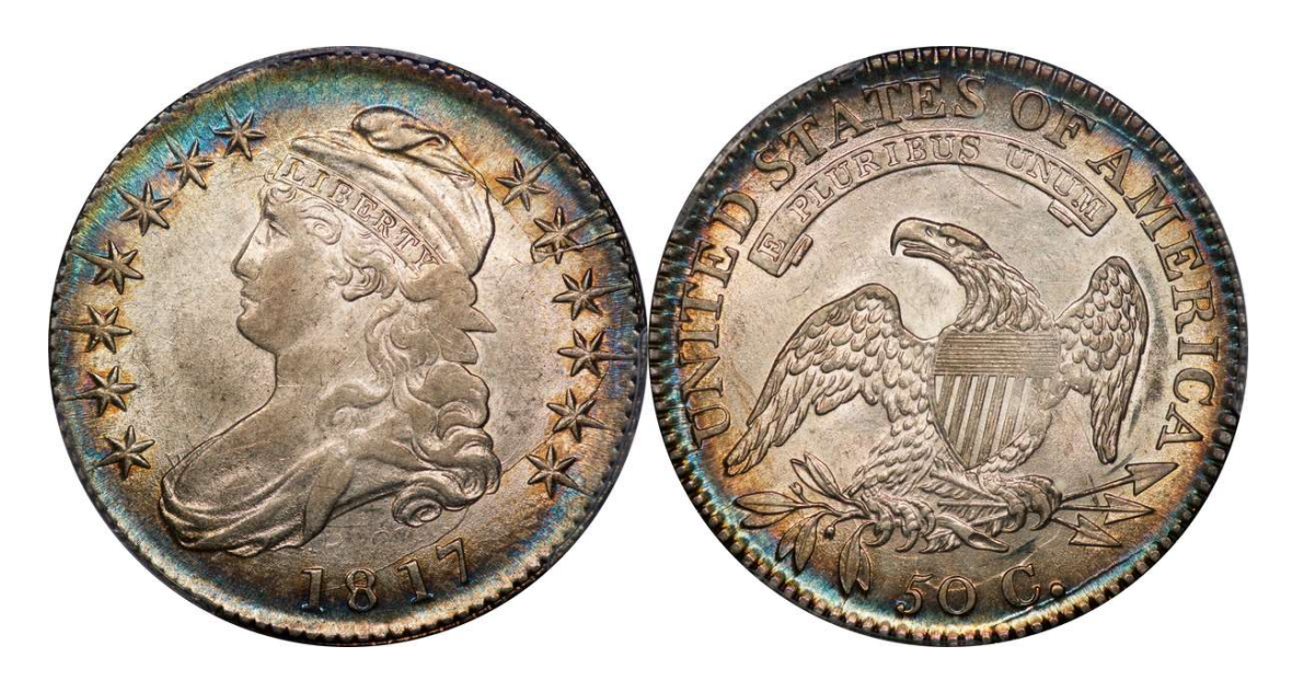
LOT 11 – 1817 O.105a R.4- PCGS AU 58