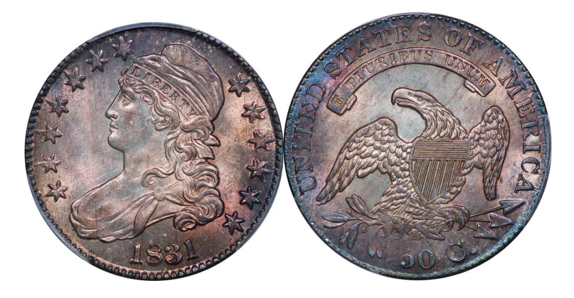
LOT 63 – 1831 O.104 R.1 PCGS MS 64 CAC

Glittering luster, as bold as the day it was struck! Pastel shades of turquoise and fiery orange grace the pristine surfaces. The detail in Liberty's tresses is dramatic. A special coin for those who seek coins of this caliber.