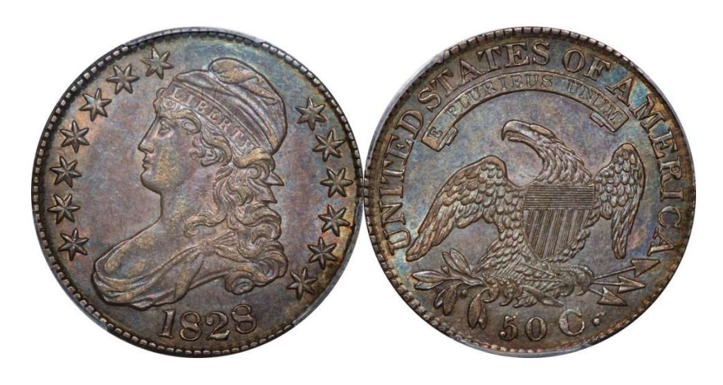
LOT 31 – 1828 Curl 2 w/ Knob O.106 R.4 PCGS AU 58 CAC

Just 2 of 23 die pairs in 1828 feature a curl 2 with knob. The 1828 O.107 is reasonably common. The 1828 O.106, offered here, is decidedly uncommon. PCGS has attributed and assigned an AU 58 grade to only two from this die pair (along with 3 mint state coins). Here is a new (to PCGS) example, last seen in August 1983. when offered in Kagin's ANA Auction, lot 2470 (auction tag accompanies). The coin is wholly original, beautifully toned, well struck and features immaculate surfaces. One cannot hope for a finer example at this grade level. It will be no surprise if this lot receives more bids than any other in the sale.