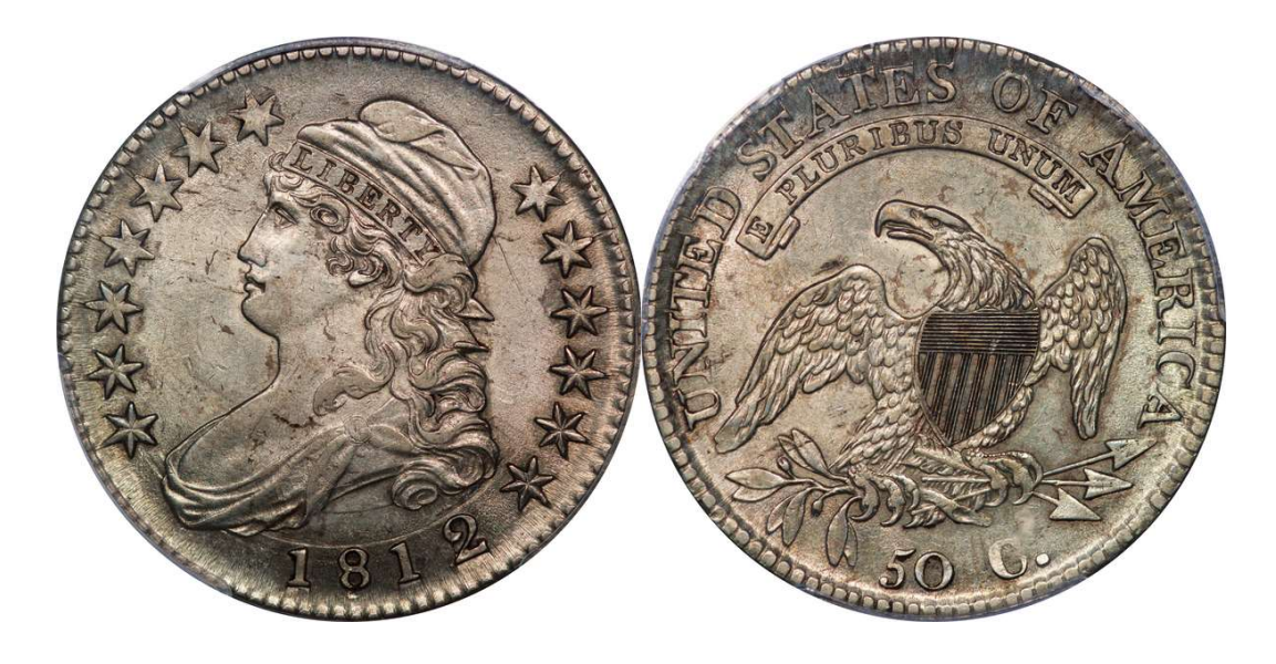
LOT 35 – 1812/1 Small 8 O.102 R.1 PCGS AU 58

Lightly toned with nearly full luster. Toning spots on and around the devices are accentuated in the photos and have little impact on the coin's eye appeal. Fairly early die state with complete dentils. Clash marks are standard for the issue. From Heritage's March 2014 San Francico sale, lot 10342, @ $4,112.50.