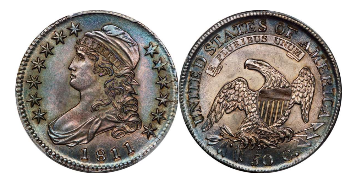
LOT 8 – 1811 Small 8 O.110a R.1 PCGS MS 62

Electric blue-green toning fails to dampen bold underlying luster. VERY sharp strike despite the somewhat late die state. You will love the near mark-free surfaces. Another high-end, colorful early date. Lance put this one away in January 2015.