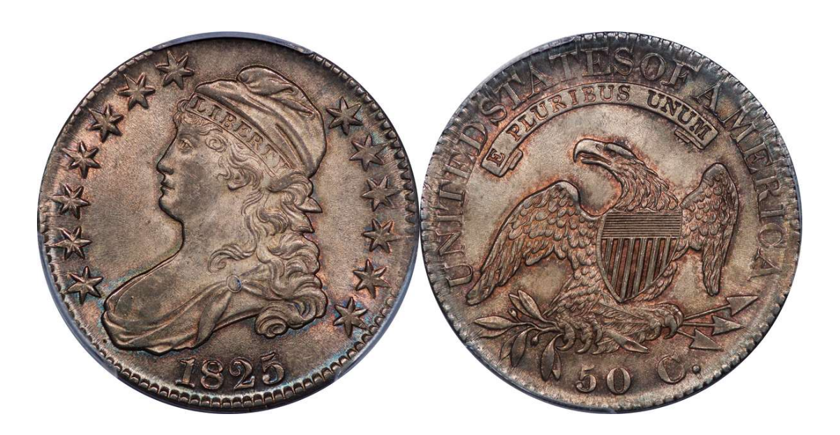
LOT 51 – 1825 O.102 R.2 PCGS MS 63 [CAC]

Another fetching bust half that lost its green CAC sticker when returned to PCGS for a new label, confirming the Overton attribution. No change in the PCGS cert No. (03145024), so no problem confirming its welcome at CAC. The creamy, steel-grey, mark-free surfaces remind me of Louis Eliasberg's bust halves. There are virtually no signs of contact or mishandling on this very special 1825. It probably deserves a gold CAC sticker.