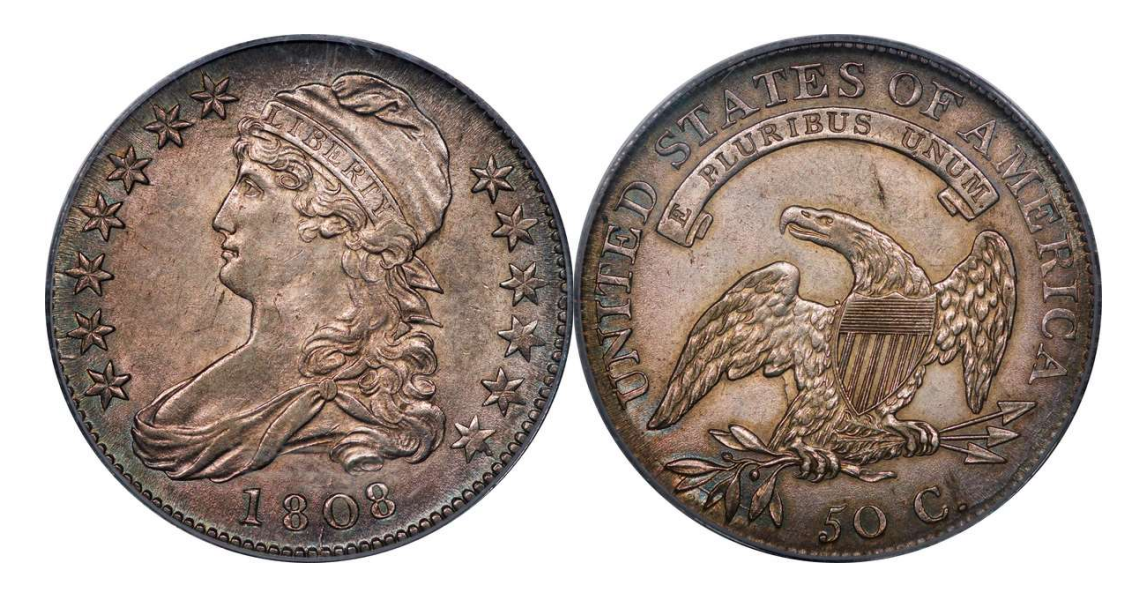
LOT 73 – 1808 O.102a R.1 PCGS AU 58

Same dies as the preceding O.102, with the usual bisecting obverse die break, below date to rim over cap. A handsome 1808. Lightly toned, darker at the rims. Cartwheel luster is undiminished in the fields.