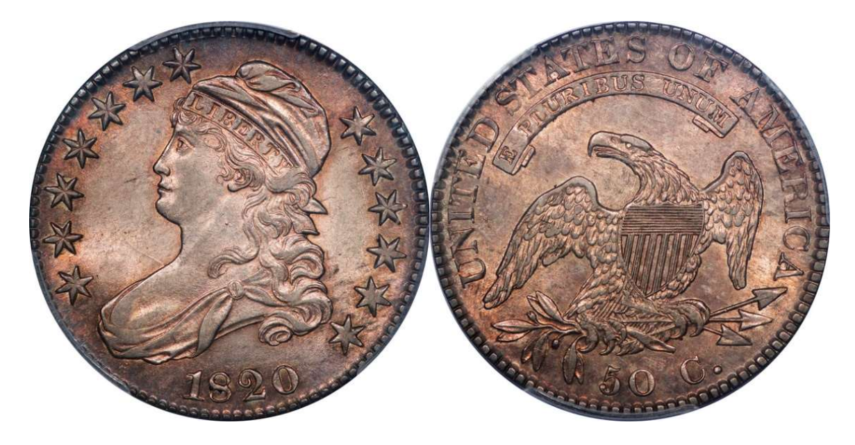
LOT 43 – 1820 Sq. 2, Lg. Date, No Knob O.106 R.2 PCGS MS 62

The chance to own a mint state 1820 is cause for celebration. This delightful example is spot-on for the grade. Luster frolics under an even, pale gold patina. High rims and distinct dentils frame the nicely impressed devices. The coin brought $3,240 when Heritage offered it in April 2021 and $3,750 in a later David Lawrence auction. PCGS suggests a current value of $4,750 while the Greysheet settles on $3,750. YOU get to decide!