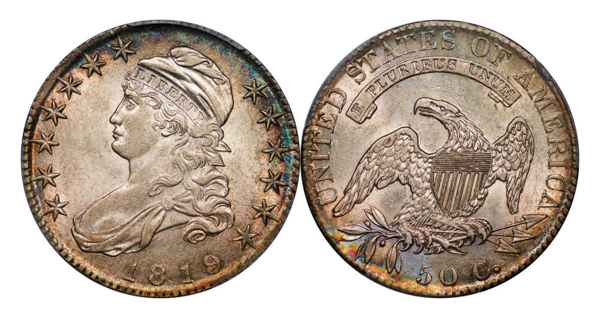
LOT 80 – 1819 O.115 R.3 PCGS AU 58

A halo of pastel gold surrounds the brilliant centers. A trace of friction on the cheek, tip of cap and highest curl – just what we expect of our 58s. Bold luster throughout. Flashy, high grade 1819s are tough to find. This one popped up in Heritage's 2017 Denver ANA sale, lot 4966, bringing $2,938.