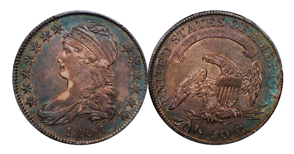
LOT 72 – 1808 O.102 R.5 PCGS XF 45