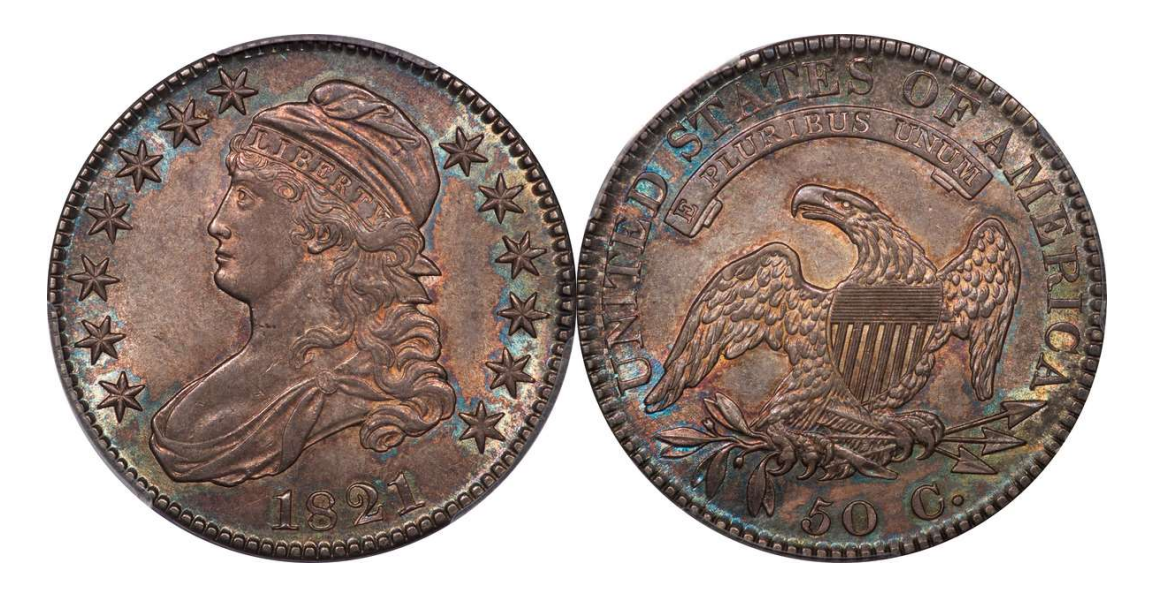
LOT 14 – 1821 O.104a R.1 PCGS AU 58

It is hard to imagine a more beautifully toned half-dollar. Full luster accents the sparkles of rose, gold and turquoise. A little rub on the cheek and breast compel the AU designation. In other respects the coin approaches gem quality. Lot preview is a must for this captivating coin.