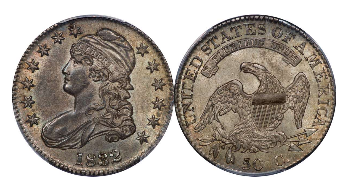
LOT 98 – 1832 Large Letters O.101a R.1 PCGS AU 58 CAC

Light to medium grey toning, 100% natural. The reverse is uncirculated, probably MS 63. The obverse may or may not be free of friction. The somewhat darker cheek worried PCGS graders. We know the coin never circulated. The surfaces are almost immaculate. In all, a glorious example of this popular Red Book variety.