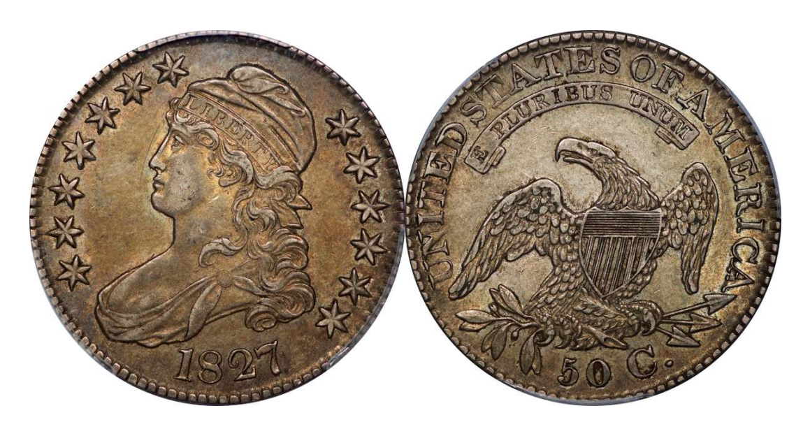
LOT 57 – 1827 Sq. Base 2 O.107 R.3 PCGS XF 45 CAC

Light to medium grey toning with russet highlights and a decent dose of luster. A handsome piece, without faults. The CAC sticker is well deserved.