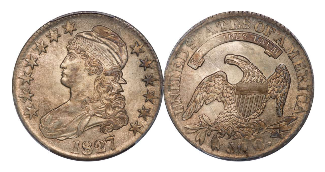
LOT 90 – 1827 Square Base 2 O.139 R.4- PCGS AU 58+