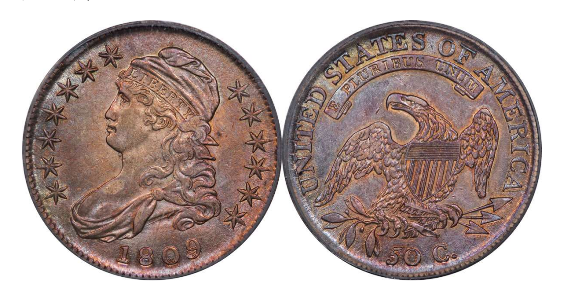
LOT 75 – 1809 O.111 R.3 PCGS AU 53

A pretty one! Pale gold blends with an antique grey patina. Decent strike for the issue, though soft at the rims. Luster and iridescence augment the eye appeal.