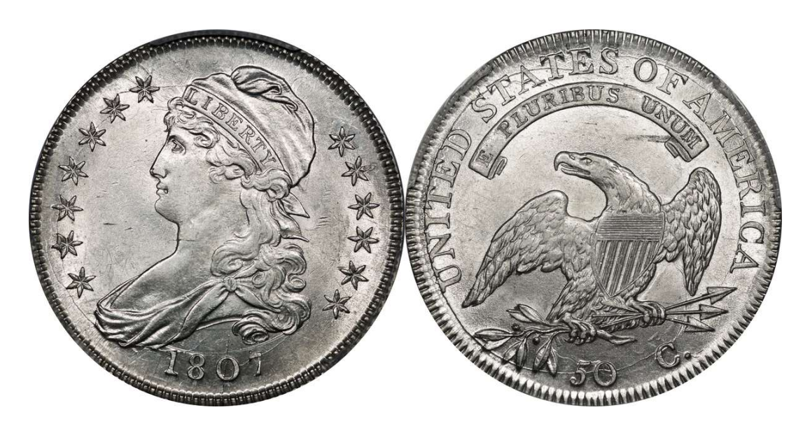
LOT 23 – 1807 Small Stars O.113a R.2 PCGS MS 62

A highlight of the Herb Turner Collection, featured in Part 3 of the Sale. Booming luster graces the smooth, nearly mark-free surfaces. High rims, sharp dentils and nicely detailed central devices are an important bonus. Weak strikes are the norm for this variety. Die breaks swirl through the stars and legend. A short, rather faint "drift mark" (planchet imperfection) under UNUM is a convenient identifier of this important coin. I've not been able to trace its lineage past its appearance in Heritage's February 2022 Long Beach sale, lot 3054, where it brought $16,500. Six months later, Turner snagged the coin at a modest discount when it reappeared in Heritage's July sale, lot 3095. Almost certainly among the top 10 or so examples of the Small Stars variety.