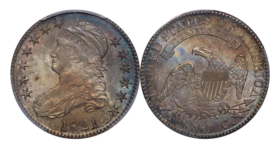
LOT 45 – 1821 O.101a R.1 PCGS MS 62 CAC

Hues of steel-blue, grey and auburn adorn the surfaces. Luster is undisturbed. Not quite the pizzaz of the preceding lot. Still, a welcome addition to a high grade date or die variety set. It brought $3,120 in Stack's/Bowers' April 2022 Central States sale.