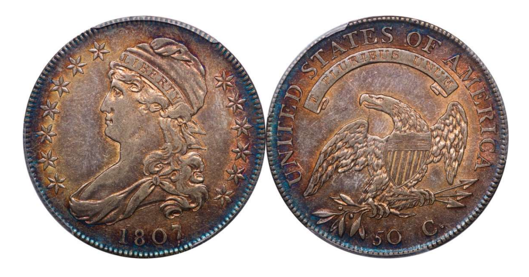
LOT 2 – 1807 Large Stars O.114 R.3 PCGS AU 53

Glowing embers of a campfire blanket the fields and devices while an iridescent ring of deep blue encases the dentils. Soft luster enhances the toning and intensifies the coin's eye appeal. A wonderful companion to the preceding small stars variety. Acquired by private treaty in October 2017 for $5,625. Estimate: $4,000 and up