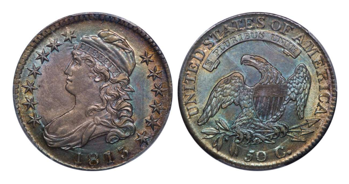
LOT 9 - 1813 O.105 R.1 PCGS AU 58