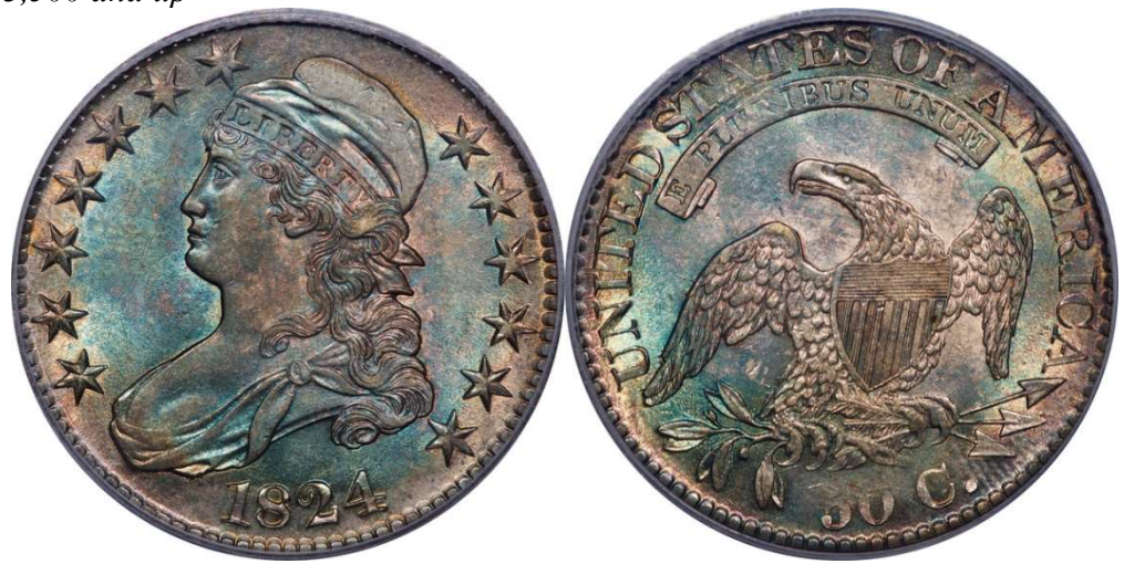
LOT 18 – 1824 O.117 R.1 PCGS MS 63