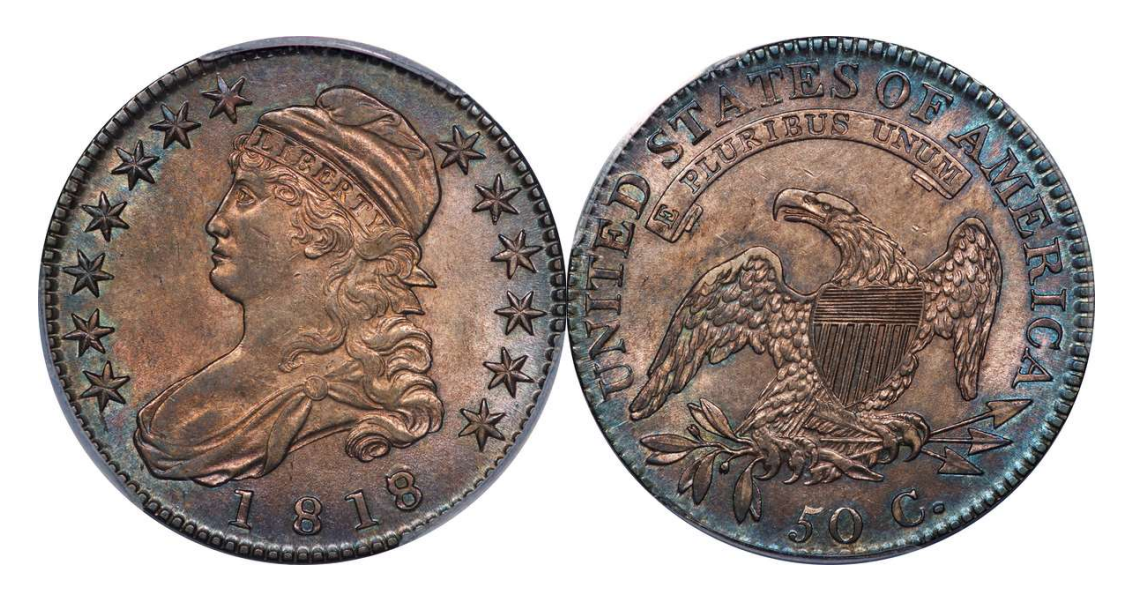
LOT 25 – 1818/7 Small 8 O.102 R.2 PCGS AU 55 CAC

The parade of beautifully toned coins continues. Here is a virtual twin to the preceding 1812 O.105a, with a bit of friction on the high points. The toning and eye appeal are off the charts. The small 8s overdate (O.102) is decidedly more difficult to locate in high grade than those with large 8s (O.101 and O.103). This coin last appeared in Heritage's January 2013 FUN Show auction, lot 4285, bringing $2,585 – without a CAC sticker!