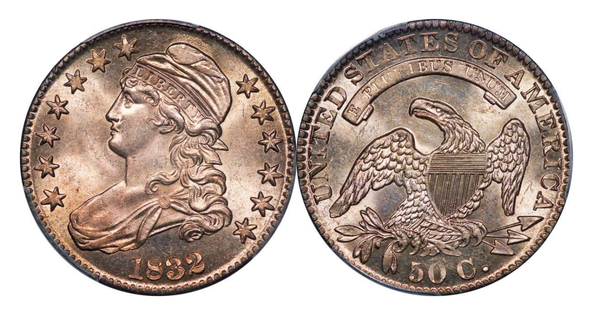
LOT 66 – 1832 Small Letters O.122 R.1 PCGS MS 63 CAC

A stunning coin. Early die state, with every detail razor sharp save the tip of the stem and UR of the motto. Brilliant, untoned, with semi-reflective surfaces. The blinding luster is off the charts. Near perfect surfaces. A remarkable, CAC approved 1832!