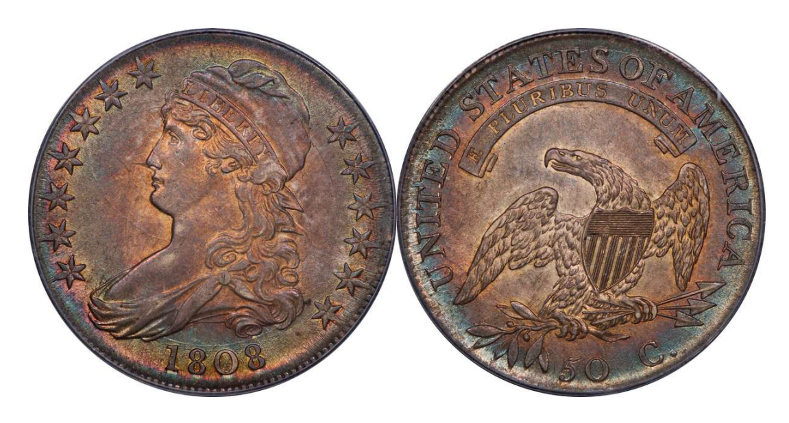
LOT 5 – 1808 O.108a R.3 PCGS AU 55 CAC

There were 27 bids on this 1808 when it appeared last year in MB 56 (lot 42), more than any other coin in the auction. Lance prevailed at $5,896. Here is a truly stunning 1808. The consignor acquired it decades ago, before grading services were born. I sent it to CAC, expecting a gold sticker to be its reward. No matter. The glorious toning speaks for itself. The surfaces and luster are a delight. This is an original coin, essentially without faults. Once again we anticipate runaway bidding.