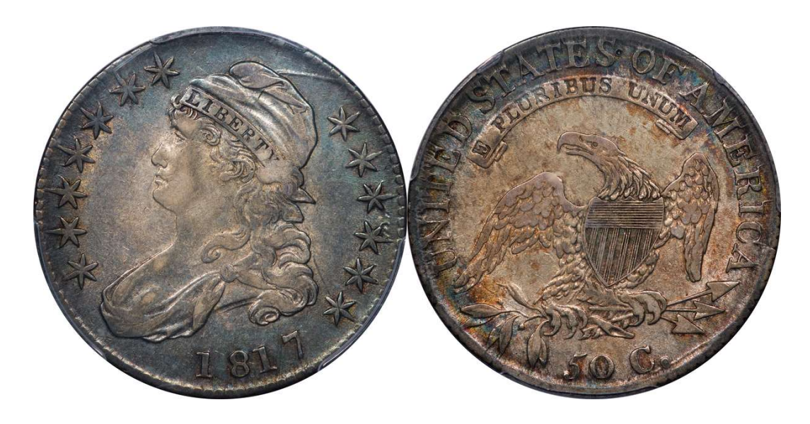
LOT 40 – 1817 Single Leaf O.106a R.2 PCGS XF 40

Cobalt blue obverse toning. The reverse is lighter. Typical soft impression throughout, a necessary evil for the poplar single leaf variety.