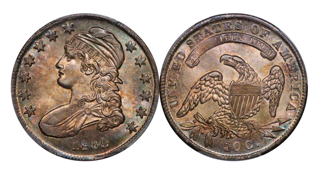
LOT 68 – 1834 Small Date and Letters O.114 R.1 PCGS MS 64