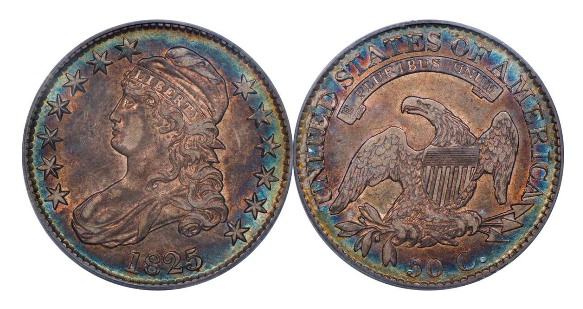
LOT 87 – 1825 O.114 R.1 PCGS XF 45

The ethereal, polychromatic toning will leave you – and this cataloger - speechless. After a short tour in commerce the coin went untouched for nearly two centuries. I've seen original toning of this sort on coins stored in leather pouches. We can only guess where this one was kept. Luster sparkles around the devices. Discard standard price guides when formulating your bid on this one!