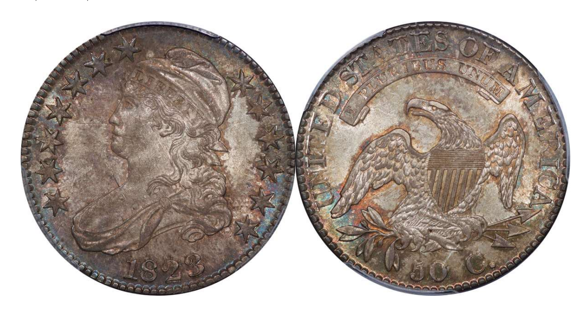
LOT 49 – 1823 O.110 R.2 PCGS MS 64

Luster runs deep and undisturbed beneath a patina that undertook its journey many decades back. Splashes of russet and vibrant copper blend with iridescent gold and turquoise. For 200+ years the stewards of this coin resisted any temptation to "improve" it. How many bust halves can we honestly say are 100% original ? This is one of the few. I was an unhappy underbidder when Stack's/Bowers offered it in its April 2022 sale of the Abigail Collection . It sold for $5,520.