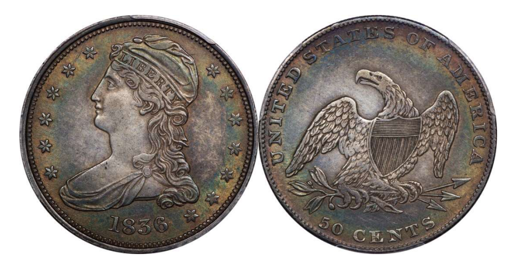
LOT 22 – 1836 RE Gr-1, J.57 R.2 PCGS AU 55

Iridescent blue, grey and gold toning frame the lighter centers. We will ignore the 1838-O and label the 1836 as the key to completing a set of reeded edge bust halves. Though short on luster, the toning and smooth surfaces justify an AU designation. The coin caught Lance's eye while cruising the bourse floor at the 2013 ANA convention in Chicago.