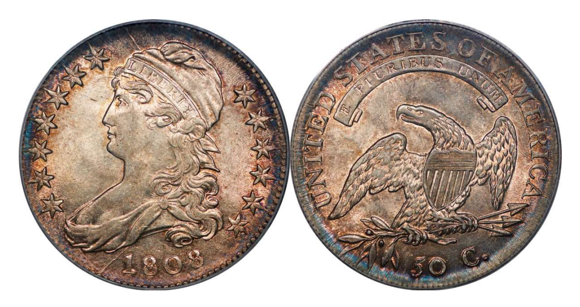
LOT 4 – 1808 O.106a R.3 PCGS OGH AU 55 CAC