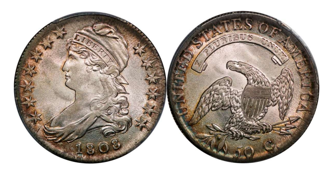
LOT 3 – 1808 O.103 R.2 PCGS MS 62

Pale russet toning at the peripheries. An eruption of cartwheel luster spills across the fields and devices. Soft rims suggest a late die state. Liberty and the eagle, however, are nicely impressed. The surfaces are free of contact marks. Stray hairlines account for the modest grade. A flashy 1808, acquired during the January 2018 FUN Show.