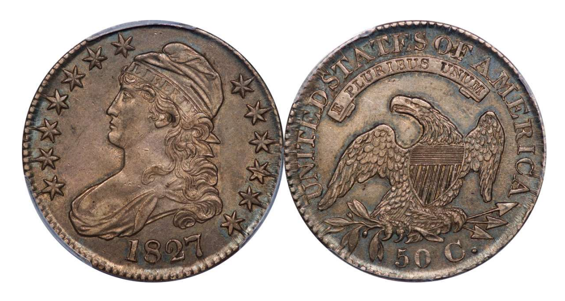
LOT 58 – 1827 Sq. Base 2 O.142 R.2 PCGS AU 53 CAC

Another evenly toned, lightly circulated bust half. I'd like more luster but can't offer a serious quibble. Decent strike and easy on the eye.