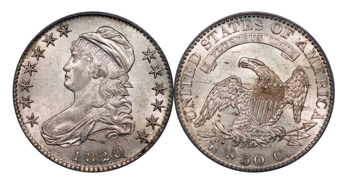
LOT 81 – 1820/19 Sq. Base 2 O.101 R.1 3 PCGS AU 55

A beautifully impressed, fully lustrous example. Note, especially, all 13 stars with center points and exquisite detail in Liberty's curls. Shallow drift marks, noticeable on the reverse, are of mint origin but probably cost this coin 3 grading points. Refining techniques were less than perfect in the 1820s. I recall my first effort to complete an AU date set of capped bust halves. Two holes went unfilled. The 1815 was too expensive. A nice 1820 was the dickens to find. Some things haven't changed over the past 40 years!