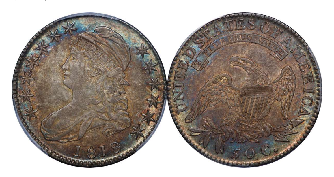
LOT 41 – 1818 O.109a R.2 PCGS MS 61 [CAC]

Exquisitely and originally toned in iridescent shades of turquoise, aqua and russet. This lovely coin lost its CAC sticker when Turner reholdered it to obtain the Overton attribution on the label. The PCGS cert no. is unchanged, allowing easy confirmation of prior CAC approval. I entered a strong bid for the coin when it appeared in Stack's/Bowers April 2022 Central States sale of the Abigail Collection , lot 2096. Not strong enough. It took $5,280 to bring it home. Early date bust halves of this caliber are few and far between. The eye appeal rating of this regal 1818 is a solid A .