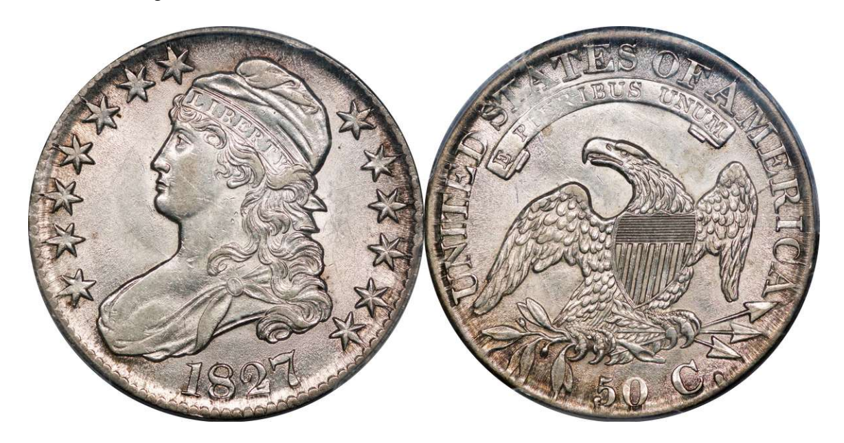
LOT 88 – 1827 Square Base 2 O.136 R.4- PCGS AU 55

A distinctly scarce die pair. Fully lustrous, just a trace of friction on the cheek. The O.136 generally appears with weak rims, as here. The centers of this example are decently impressed. I offered this flashy coin in my autumn 2019 fixed price list, receiving multiple orders. Expect competition once again.