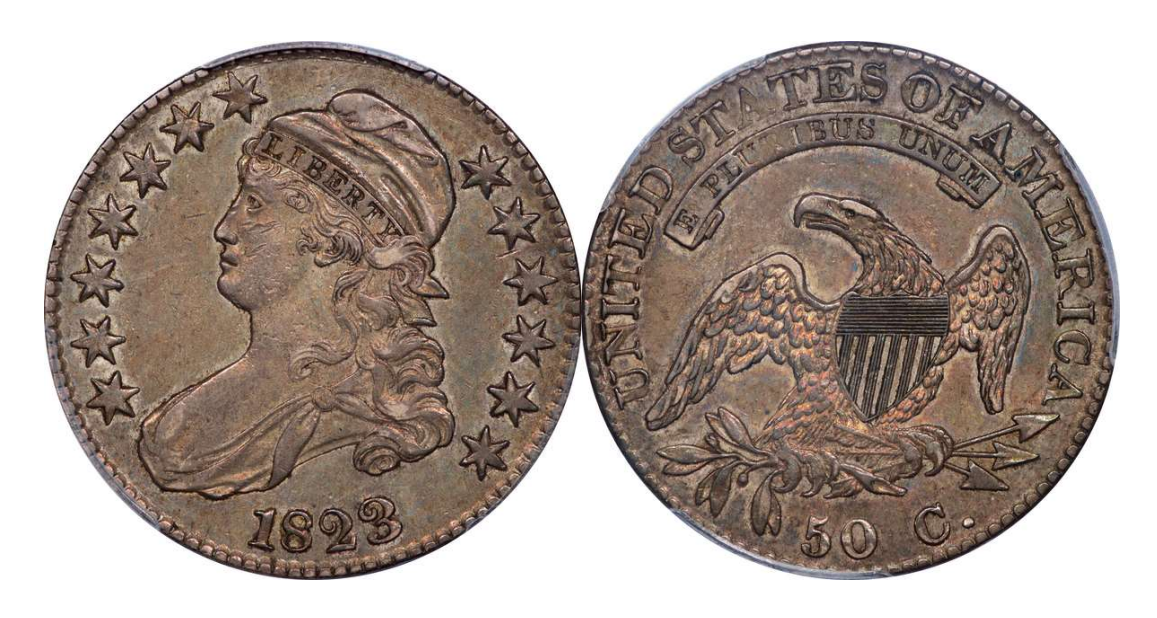
LOT 48 – 1823 O.108 R.3 PCGS AU 50 [CAC]

Another handsome coin that lost its green CAC sticker when returned to PCGS for a new label, confirming the Overton attribution. No change in the PCGS cert No. (15741889), so no problem confirming its prior success at CAC. A protective blanket of chestnut toning is the reward for decades of proper storage. Luster frames the stars and devices.