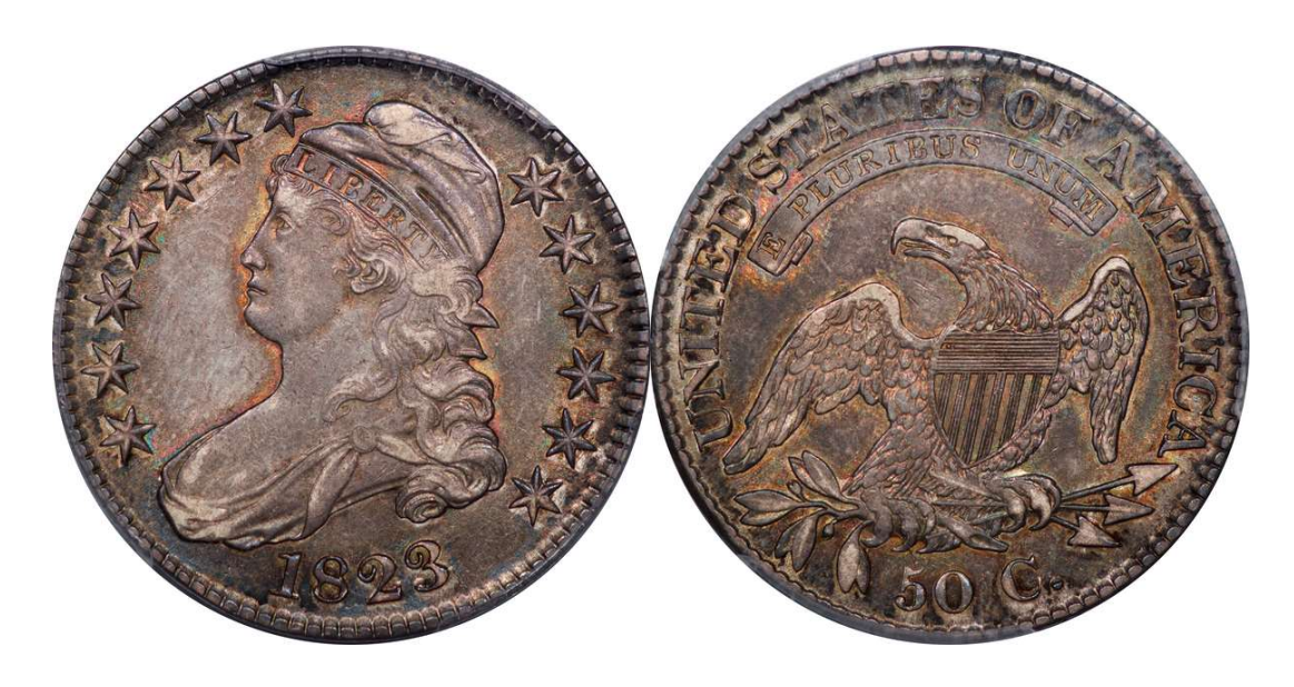
LOT 85-1823 O.105 R.1 PCGS AU 53 CAC

Antique grey with iridescent russet and gold highlights. The stars twinkle with luster. Superior eye appeal and problem-free surfaces earned CAC approval. (The slab photo was taken before its submission to CAC.)