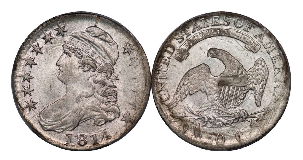
LOT 77 – 1814 E/A O.108a R.1 PCGS AU 53

A lustrous example of this Red Book staple. Silver toning, with a swath of russet on the reverse. Rarely seen adjustment marks (or are they planchet striations?) cross the weakly struck arrow tips and end of the legend. A fascinating remnant of the early mint: engraver's error + extensive clash marks + grossly worn dies + a planchet anomaly. You have to love this coin – and its history!