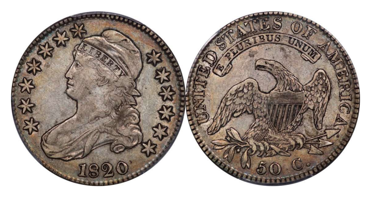
LOT 83 – 1820 Lg. Date, No Knob O.106 R.2 PCGS XF 45 CAC

Evenly worn with medium grey toning. Some luster survives in protected areas.