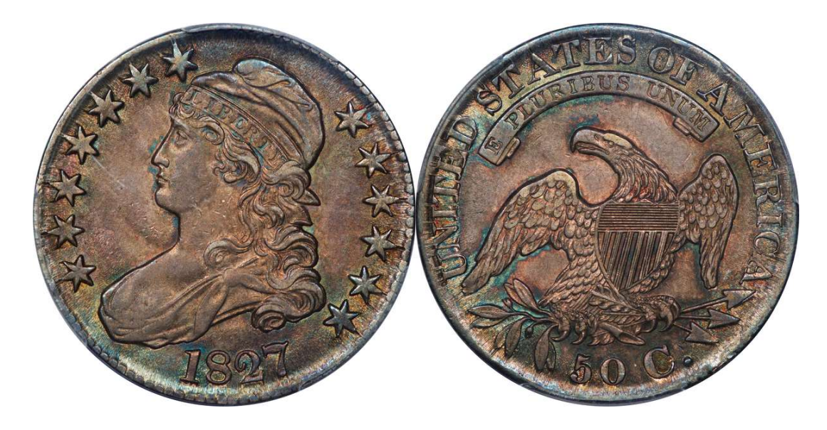
LOT 91 – 1827 Square Base 2 O.141 R.3 PCGS MS 61

Another toned beauty. Luster and iridescent colors unite, creating music for the eye. Soft rims and a touch of cabinet friction atop the eagle's wings kept this one away from an even higher designation.