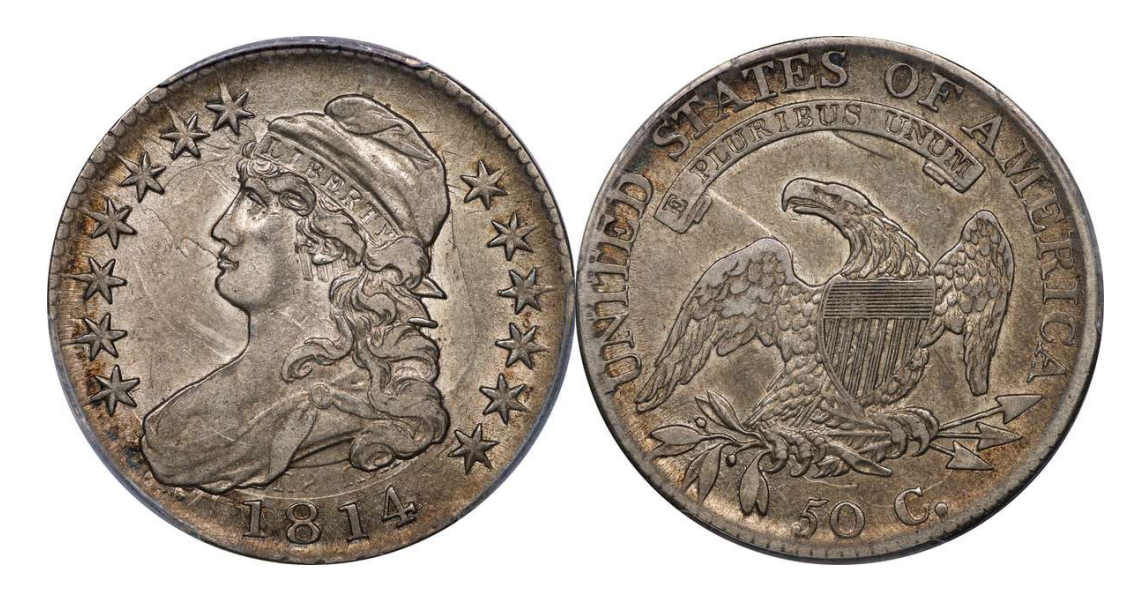
LOT 39 – 1814 O.105 R.2 PCGS XF 45 CAC

Natural silver-grey with a delicate halo of russet. Luster befits an AU coin. A sweet coin for the grade. A private treaty acquisition during the April 2022 Central States Show.