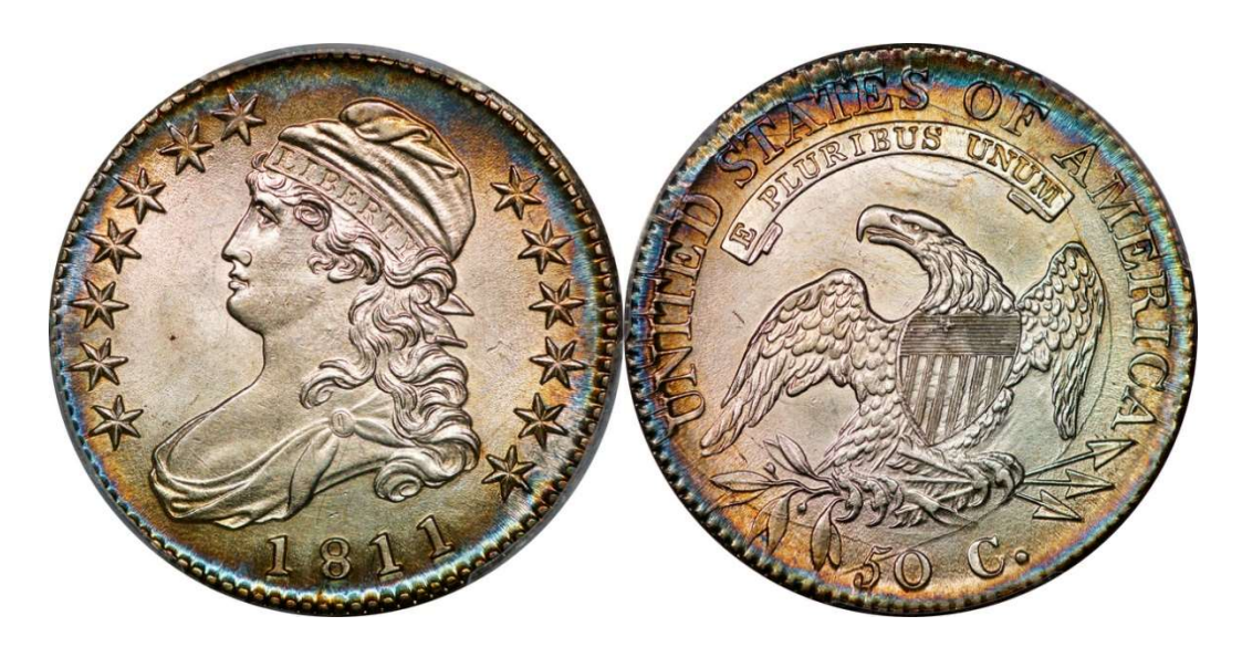
LOT 7 – 1811 Small 8 O.105a R.2 PCGS MS 62