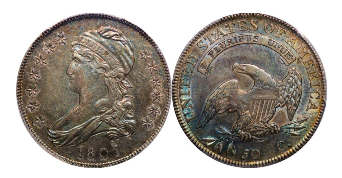
LOT 1 – 1807 Small Stars O.113a R.2 PCGS AU 53

The semi-prooflike surfaces are bathed in resplendent shades of blue, gold and electric cobalt. Color enthusiasts will find the coin irresistible. High rims and crisp dentils frame this stunning 1807. The obverse strike is well above par for the issue: all 13 stars retain their center points. The reverse displays weakness in the usual areas - the eagle's head, neck and top of left wing. The coin brought $6,462 when offered in Legend's September 2016 sale, lot 317. A prize for the collector who has patiently waited for the right coin to fill that niche in his or her set of 1807s.