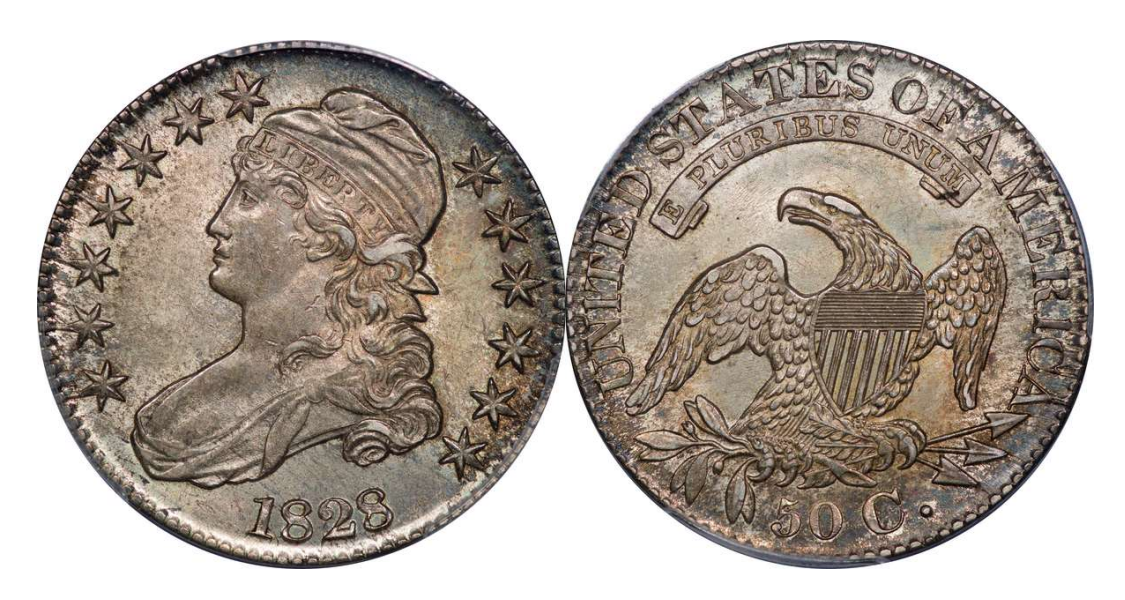
LOT 61 – 1828 Sq. Base Knob 2, Sm. 8s, Lg. Lets. O.120 R.2 PCGS MS 62

A prize for those who enjoy the look of "grey dirt." The protective silver-grey patina takes years to develop and is a sure sign of originality. Luster runs deep on this impressive coin. The surfaces are wholly unblemished. A sweet coin in all respects.