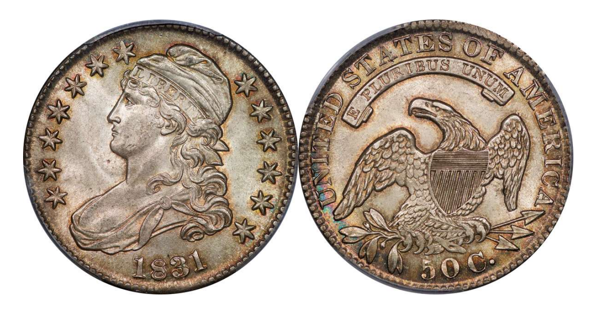
LOT 62-1831 O.103 R.1 PCGS MS 62+ CAC

Imposing cartwheel luster flows across the devices. The stars and legend are encased in iridescent copper, a nice bonus. There are no significant striking weaknesses; the surfaces are wonderfully smooth. This is a great coin for the type collector: common date, common variety – in uncommon condition.