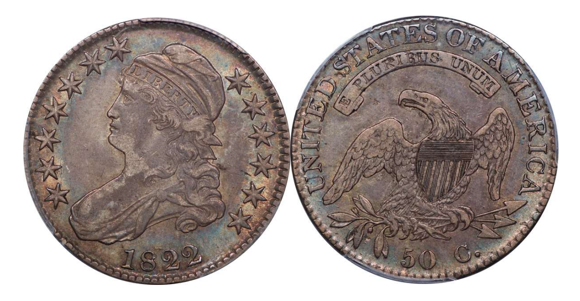
LOT 47 – 1822 O.110a R.2 PCGS XF 45 CAC

An unashamedly original bust half. The antique toning sparkles with golden iridescence inside the stars and legend. Even wear, soft luster and free of distractions. Nice!