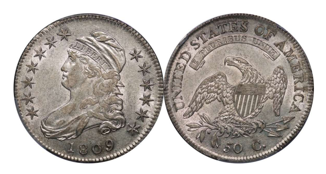
LOT 34 – 1809 III Edge O.109 R.3 PCGS AU 53

Nearly full luster blankets the untoned surfaces. Early die state. Generally sharp devices. Very few contact marks. Stray hairlines suggest the coin was gently wiped and account for an otherwise conservative grade. A popular Red Book variety with consistently strong auction prices. From Heritage's December 2021 sale of Frank Benick's ("Founding Fathers") Collection, lot 91109, @ $1,440.