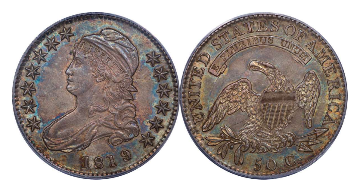
LOT 79 – 1819/8 Large 9 O.103a R.3 PCGS AU 55 CAC