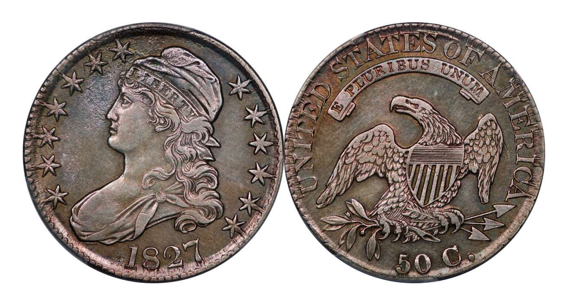
LOT 89 – 1827 Square Base 2 O.137 R.6- PCGS XF Detail

The PCGS label correctly notes, "surfaces smoothed." A shame. The `27-137 is a classic rarity. An XF example, without problems, is a 5-figure coin. Let's focus on the bright side of this coin - it is affordable and has plenty of detail. The effort to remove whatever was on the coin left it with shiny surfaces. An area of corrosion lies in front of Liberty's face. Still, we cannot ignore the rarity of this die pair. Those who insist on an attractive, high grade example may never fill that hole in their die variety set. Here is a tip for cherry pickers. Turn over any 1827 with a softly struck obverse and look at the I-T relationship. If the I is full left of the T, buy the coin! No other 1827 has that unique relationship.