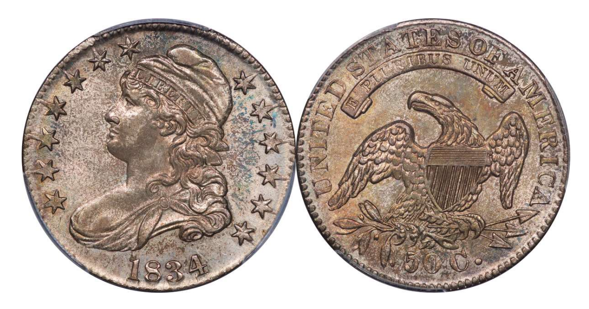
LOT 67 – 1834 Large Date and Letters O.101 R.1 PCGS MS 63 CAC

Light to medium steel-grey toning, a tad mottled but thoroughly original. Very nice surfaces. A common date and variety, just right for a date or type collector.