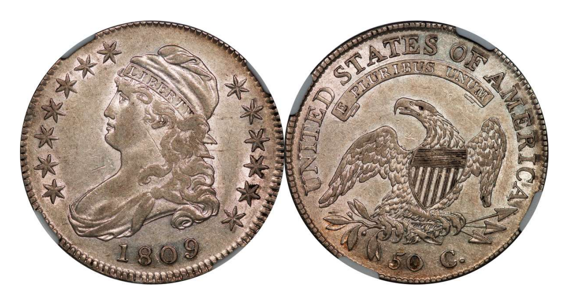
LOT 74 – 1809 III Edge O.109 R.3 NGC XF 45

Luster and surfaces befit an AU 53 designation! Sharp early die state, without the typical die break through AMERICA. The III edge feature is readily visible between prongs on the NGC capsule.